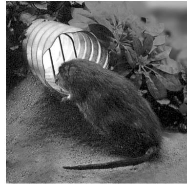
Keep rats and other pests out of any drainage system.