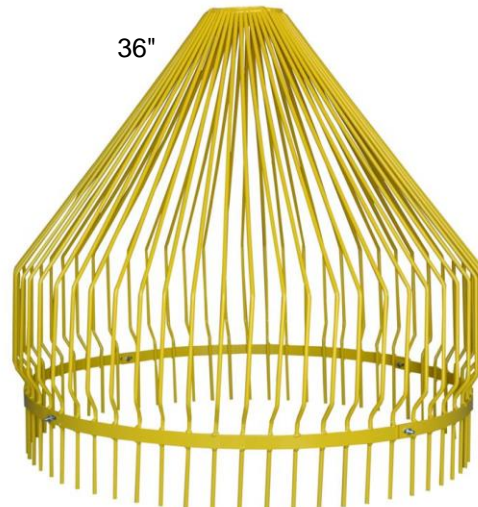
36", 42", and 48" are in four pieces. (Bolts, washers, and nuts are included.)