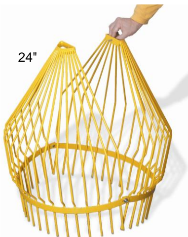
24" - 30" Bar Guards are in two pieces. (Bolts, washers, and nuts are included.)

*Special-sized Bar Guards to fit 12" Hickenbottom Intakes and 15" pipe.