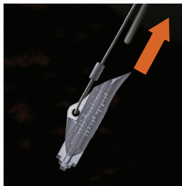
Remove Drive Steel