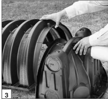
3 Place first chamber onto end cap.

3. Place the inlet end of the first chamber over the back edge of the end cap.