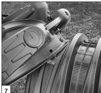
7 Attach end cap to chamber.

6. Where the system design requires straight runs, use the StraightLock™ Tabs to ensure straight connections. To activate the tabs, pop the tabs up with your thumb and lock into place.