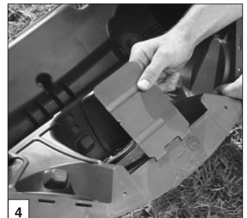
Install splash plate.