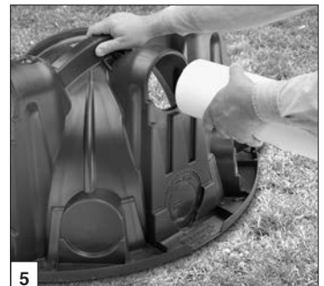
Insert inlet pipe.