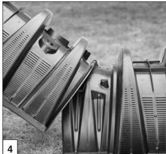
4 Connect the chambers.

4. Lift and place the end of the next chamber onto the previous chamber by holding it at a 90-degree angle. Line up the chamber end between the connector hook and locking pin at the top of the first chamber. Lower to the ground to connect the chambers.