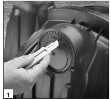
Start tear-out seal.