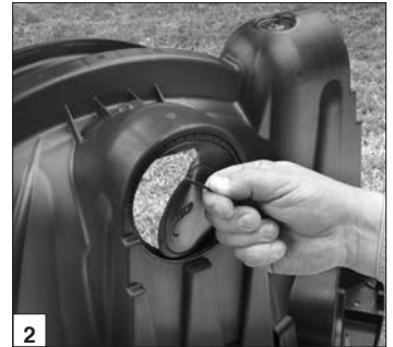
Pull tab on tear-out seal.