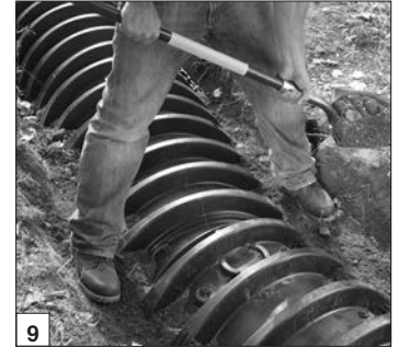
9 Walking-in the fill.

angle and insert the connector hook through the opening on the top of the end cap. Applying firm pressure, lower the end cap to the ground to snap it into place. Do not remove the tear-out seal.