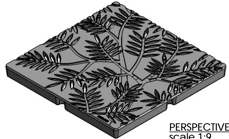
PERSPECTIVE scale 1:9