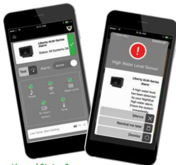
Normal Status Screen