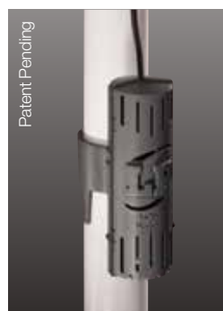
Snap-on Compact Float Model ALM-P1-EYE (Sump Pump Applications)

New! Super-bright LED alarm ring - Increases visibility