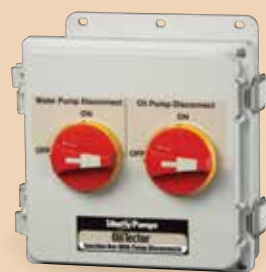
Junction Box with Pump Disconnects NEMA 4X

Complete system - includes pumps, control panel, level sensor, junction box with disconnects, check valves, reducer couplings and remote alarm (no holding tank)