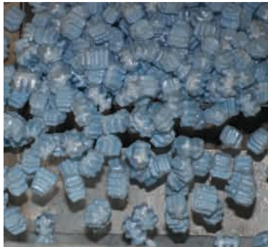
Patented EZ-Drain Beads