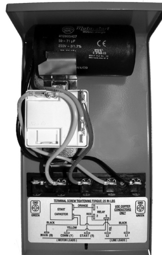
Tab Up ②